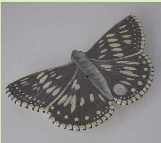
A rendition of the checkered skipper created by volunteer Katie Tankersley and displayed at the Panhandle Butterfly House.

The adults love to feed on nectar of some common white-flowering "weeds" including shepherd's needles, fleabane, and asters; also red clover, knapweed, beggar's ticks, and many others.